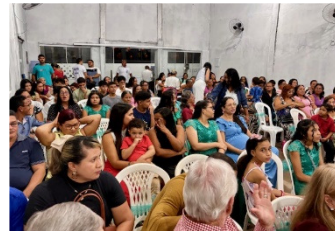
Nightly church crowd