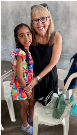
Patti with beautiful young lady