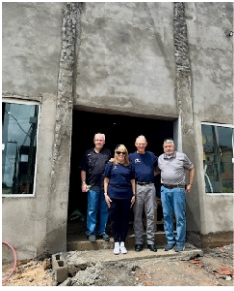
Church front unfinished