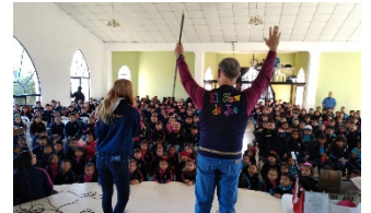
Robinson School, Chimaltenango, Guatemala. March 12, 2020

We have been so busy at home that we haven't noticed much change to our "social distancing" except we can't go to church and worship like we are used to doing. As mentioned last month, we made it home from Guatemala the day before this all came about. As of this week, if over 60 years old there, you can't leave your place of residence! Here is a great picture of the 400+ kids at the program two days before schools were closed. Glory to God!